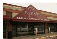
Grounds for Celebration