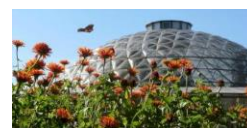
DM Botanical Ctr.