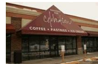
Grounds for Celebration